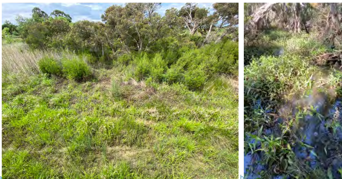
Plate 3 Habitat edge vegetation at Site DG2 showing Melaleuca recruitment (a) and existing retained habitat (b)

During the survey sites DG1 and DG3 had mostly dried, with negligible surface water present at the time. habitat conditions at these sites were similar to previous years of monitoring with some sparse patches of aquatic and emergent vegetation and an overstory of Melaleuca, in much the same condition as during previous years of monitoring.