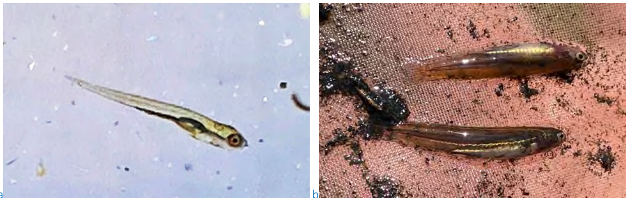
Plate 1 Larval (a) and adult (b) Dwarf Galaxias