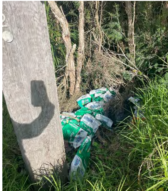
Photos 16-19. Litter inside the offset site and dumped tyres in the Swamp Scrub along Centre Road.

Some roped bunting was observed along the interface of the existing wetland vegetation and the revegetation track, in the southern part of the offset site (Figure 1). This was evidently used to prevent accidental encroachment into the vegetation during construction of the revegetation track, however it currently does not appear to serve a purpose and some sections had fallen. The rope bunting should now become part of the rubbish removal effort.