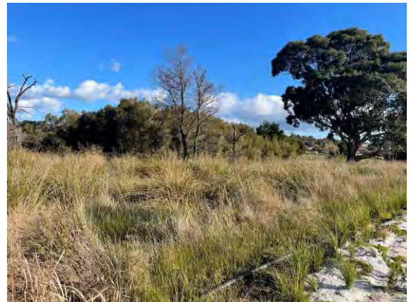
Photos 10-14. Top left – Weedy area along the dirt track. Top right – Entrance point at the northeastern part of the offset site. Bottom left – example of Toowoomba Canary-grass dominated area. Bottom right – weeds along the revegetation track in the southern part of the site.