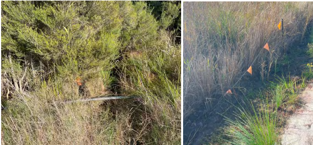
Photo 20-21. Rope bunting along the southern portion of the revegetation track.