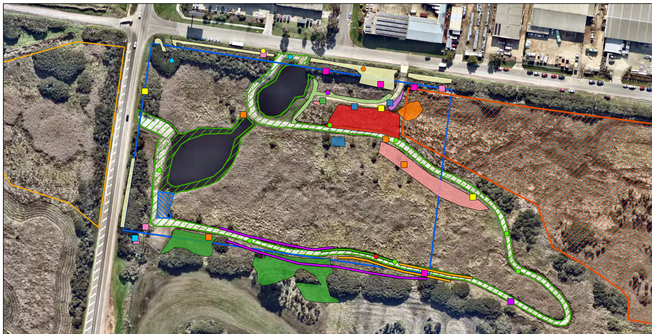
Figure 1: Study area and monitoring observations

Project No: 14090_07 Project: 96-166 Centre Road, Narre Warren Date: 26/06/2024