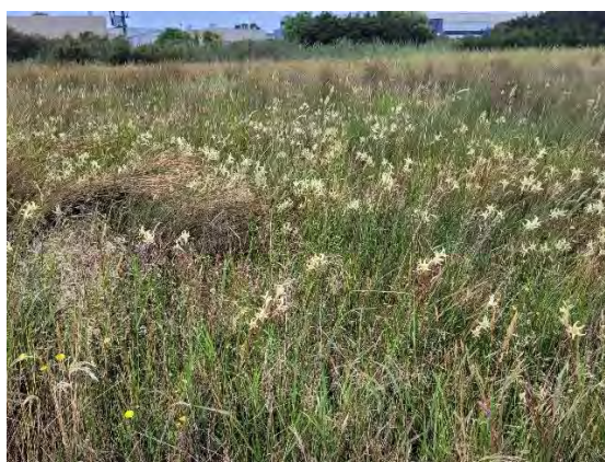
Photo 9. Area of Wild Gladiolus infestation mapped and photographed in December 2023.

During the baseline survey which occurred in summer, a large infestation of Wild Gladiolus was also observed at the northern part of the offset site (this area is included in Figure 1), as well as scattered individuals around the site. Due to the winter timing of the current survey, this weed species was not flowering and therefore a lot less conspicuous to detect. Therefore, though not seen in this survey, it should be assumed that they are still present.