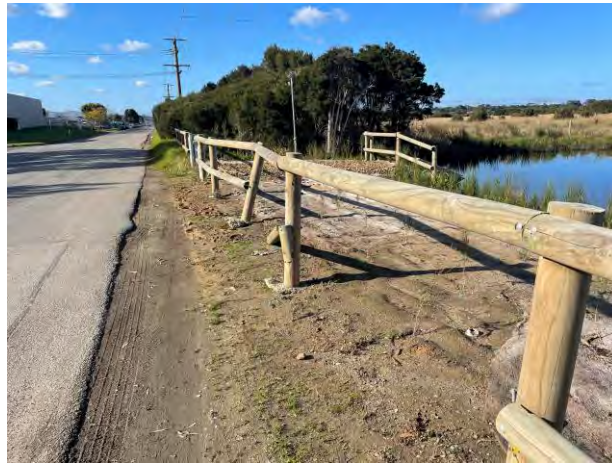
Photos 15. Damaged perimeter fencing next to the entryway at the northern boundary.

Permanent fencing was installed at the two refuge pools as indicated on Figure 1. The current perimeter fencing along the northern boundary does not prevent members of the public from accessing the offset site (this appears to be intentional as there is an open entryway incorporated into the fence). However, this leaves the revegetation works vulnerable to vandalism and damage as shown by the dumping of rubbish within the offset site. The survey found that the northern fencing had been damaged, likely by vandals (see photo below and Figure 1).