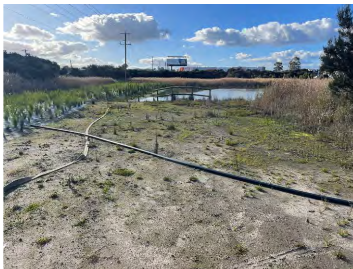
Photo 22. Non-vegetated area at the southwestern part of the offset site.

The current monitoring found an area at the southwestern part of the offset site that was generally devoid of vegetation, except for recolonising small plants and weed species (see photo below and Figure 1). This area appeared associated with access to the southern refuge pool from the entryway at the south-west corner of the site. It is currently not known what the intention for this area is, i.e. whether it is for maintenance vehicle access or if it will be left to become wetland vegetation naturally. As weeds have begun colonising this area, there is increasing threat of invasion to the adjacent existing native wetland vegetation and revegetation works.