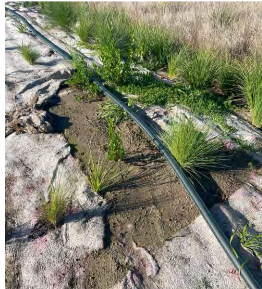
Photos 5-8. Revegetation works at refuge pools and revegetation track. Some damaged erosion matting.