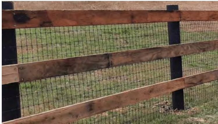
Image 1. Example photo of mesh fencing.